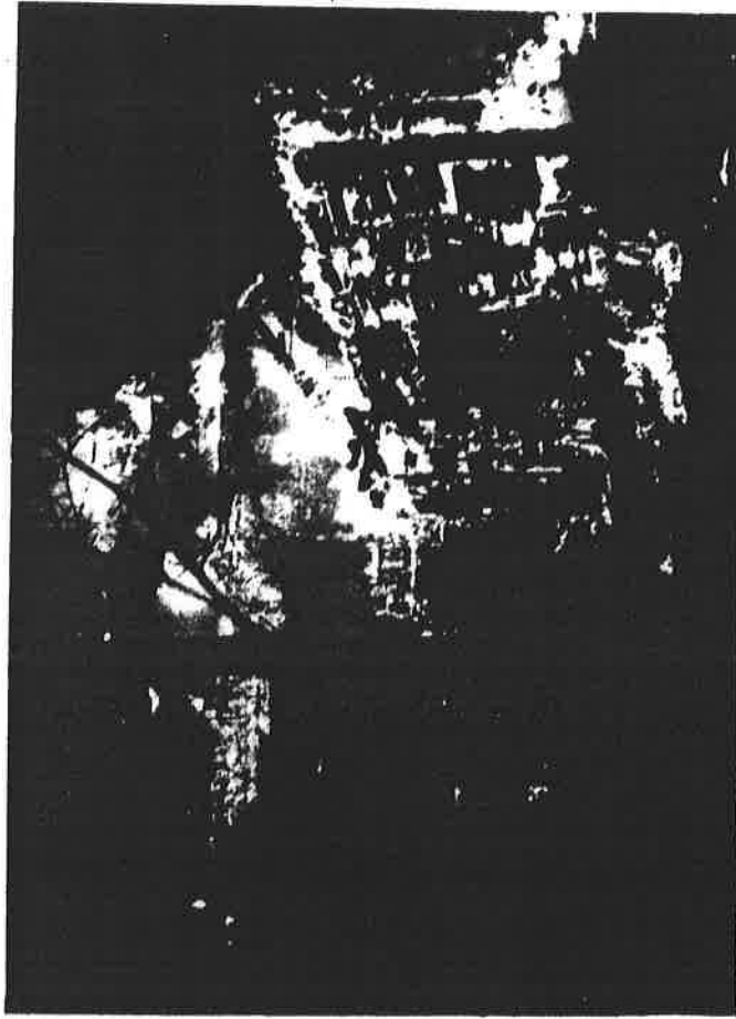
Fire swept through Harper House, a Belknap College dormitory in Center Harbor early this morning injuring three of the 22 students asleep in the building at the time. The two house parents also had a narrow escape.